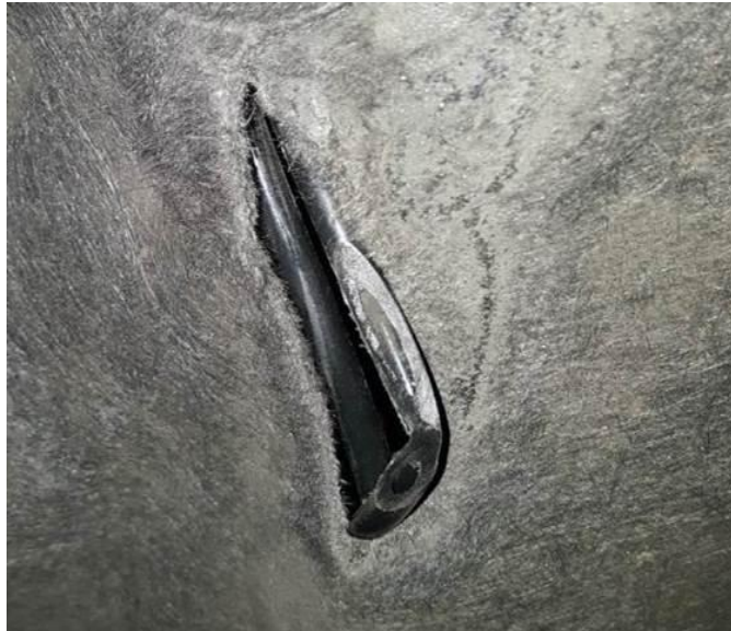
Fig. 1 Close Up Of Damaged Air Line And Wheelhouse Splash Shield