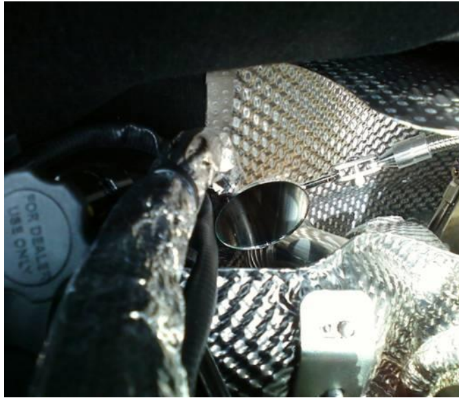
Fig. 1 Inspection