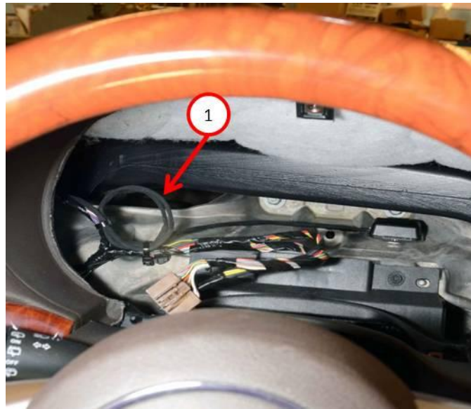
Fig. 6 Extra cable coiled and zip tied