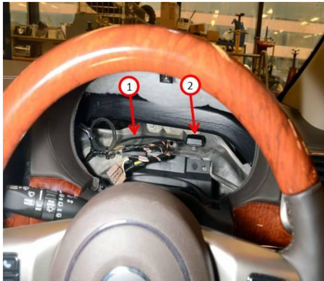
Fig. 5 GPS antenna installed and wire routing