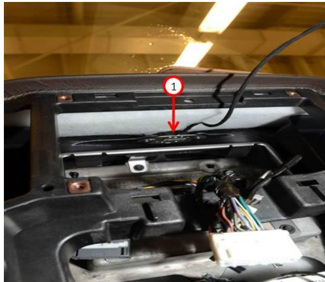
Fig. 2 Factory installed GPS antenna location

1 - Location of factory installed GPS antenna