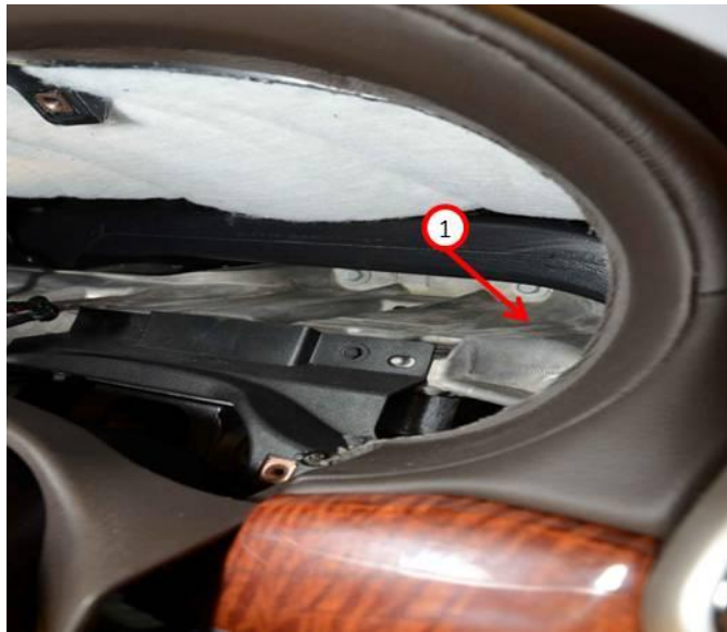
Fig. 4 Location for new GPS antenna

1 - Location where to install the new GPS antenna.