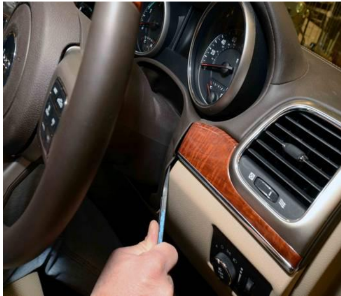
Fig. 1 Removing column seal with trim stick

NOTE: This is the seal in step 3 of the removal procedure. The clips need to be released and then position the steering column seal back. This gives more clearance to aid in the removal of the cluster.(Fig. 1)