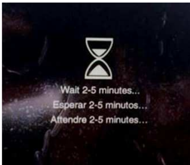
Fig. 3 Hourglass Screen

NOTE: During the update process you will see multiple hourglass and “Please Insert Update USB” screens for extended periods of time (several minutes) (Fig. 3) or (Fig. 4) . DO NOT remove the USB flash drive at this time. Only remove the USB flash drive when the update has completed, when the screen displays the software levels again. The screen will say “Software updated successfully”.