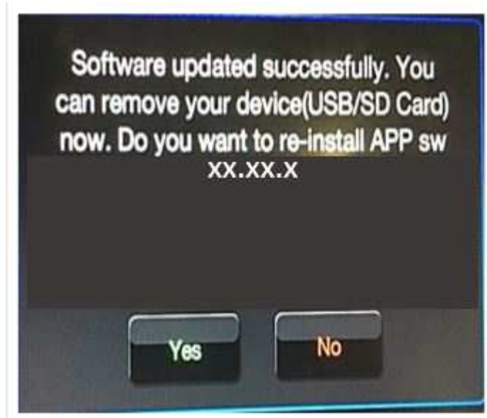
Fig. 5 Software Updated Successfully