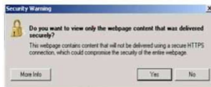
Fig. 2 Pop-up Security Message

NOTE: A blank USB flash drive must be used to download the software. Only one software update can be used on one USB flash drive.