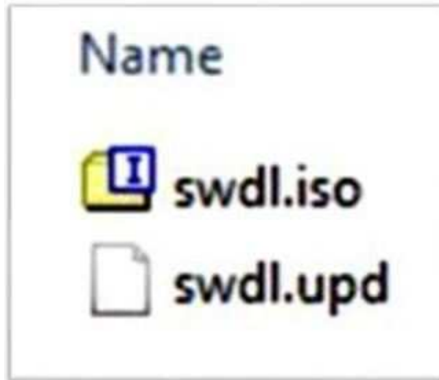
Fig. 1 Two USB Files

NOTE: Two files will be loaded onto the USB flash drive (Fig. 1) .