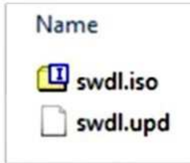
Fig. 1 Two USB Files

NOTE: Two files will be loaded onto the USB flash drive (Fig. 1) .