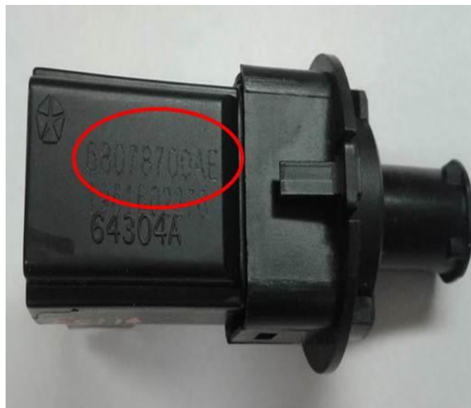
Fig. 3 Correct Part Number