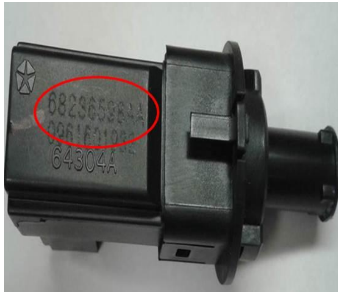
Fig. 2 Incorrect Part Number

NOTE: The two stop lamp sensors visually look identical except for the part number stamped on them. Incorrect Mopar P/N is 68236598AA (Fig. 2), the correct Mopar P/N is 68078700AE (Fig. 3).